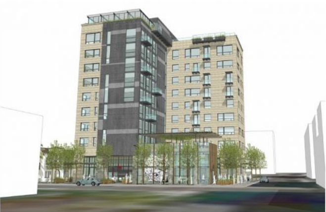
STREET VIEW OF SOUTHWEST CORNER