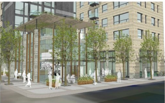
COURTYARD PERSPECTIVE - GROUND