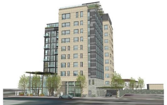
STREET VIEW OF SOUTHEAST CORNER