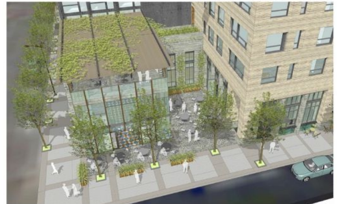
COURTYARD PERSPECTIVE - AERIAL